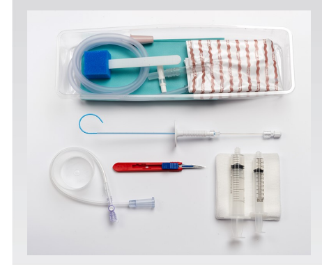
R58800-06-BK Rocket BLUE™ Drain Ward Procedure Pack

For insertion into, but not restricted to, the abdominal cavity, chest and urinary bladder using a 'direct stab' technique combined with aspiration and/or ultrasound guidance.